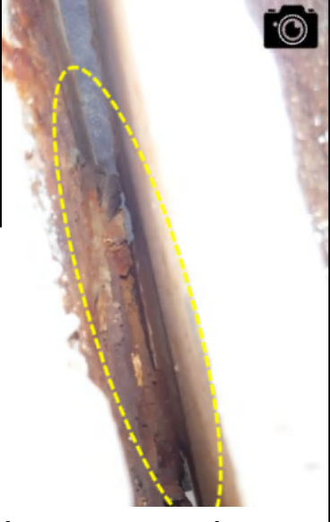
Not enough maintenance is carried out.

There was an oil leak from wire drum shaft. As a result of investigtion, it was found that bearing covers for drum shaft were badly corroded. Since there was no problem for launching the boat, they later tried renewal of bearing covers during the dock-in. However, because the stuck was so bad, the wire drums could not be removed even if it was pulled hard or moved by bar. The drums were finally removed with a hydraulic jack and hot work.